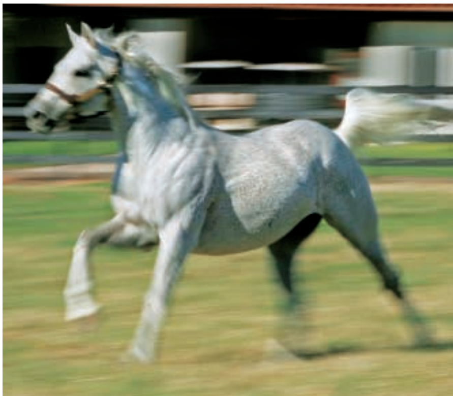
Magali Farms' stallion Lit de Justice runs in his paddock