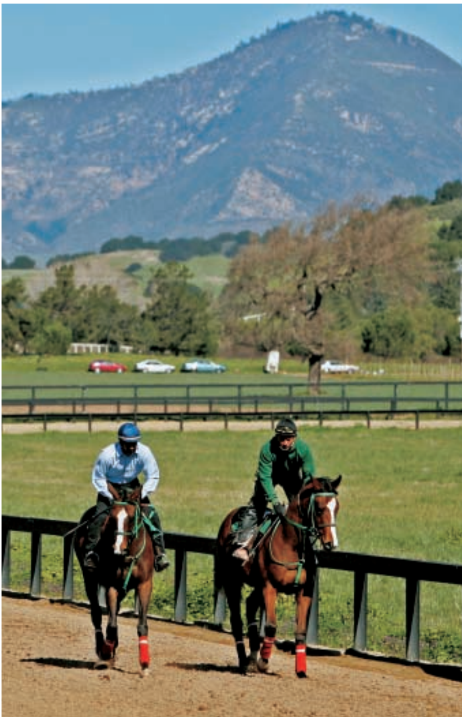
Horses getting a workout over the training track at Magali Farms

mane out there. I have one person full time and all he does three or four days a week is put hoof dressing on the broodmares. Otherwise their feet get all dry and cracked.