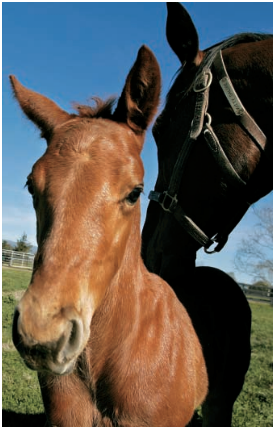
One of the new arrivals at Magali Farms

thing, do it right. We don't pinch corners; we do things that cost money. Our customers understand that our rates are not inexpensive, but the service exceeds their expectations.