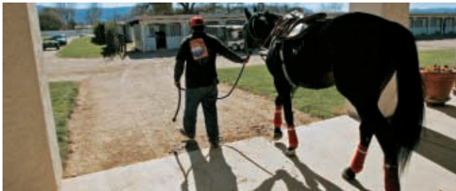
A horse heads to the training track at Magali Farms